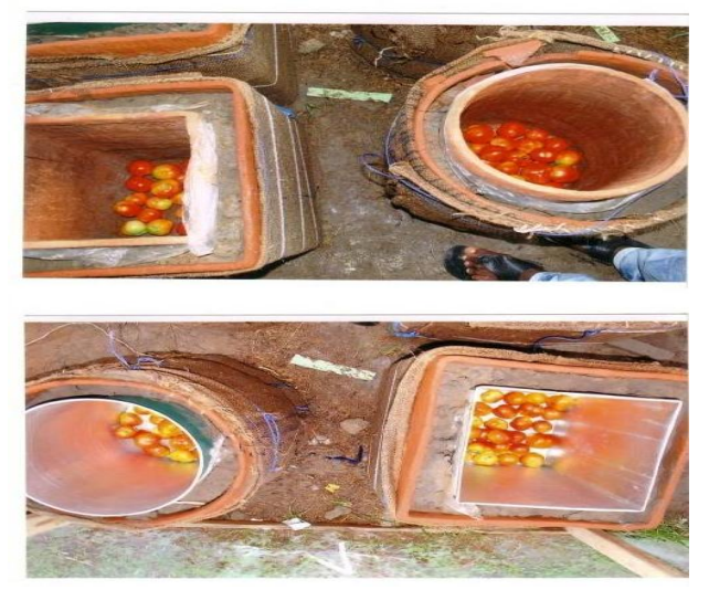
Fig. 3. The inside of the strorage structures.

Fig. 2. Parts labelling of the square structure.